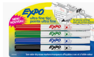
Low Odour Dry Erase Markers Ultra Fine ...